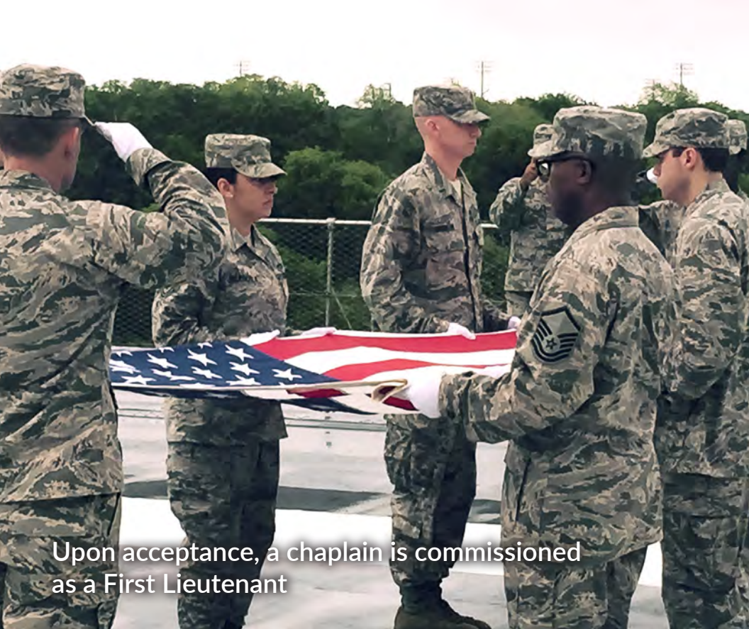
Upon acceptance, a chaplain is commissioned as a First Lieutenant